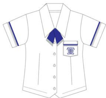
Formal Uniform - Girls Senior White Blouse - Short Sleeve and Tie