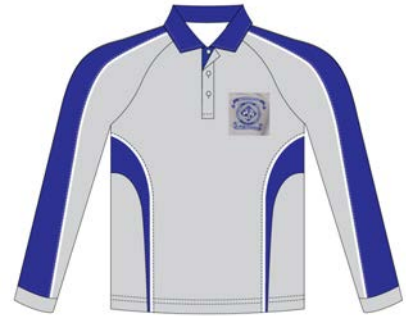
Sport Uniform Casual Polo Shirt - Long Sleeve