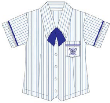
Formal Uniform - Girls Junior Striped Blouse - Short Sleeve and Tie