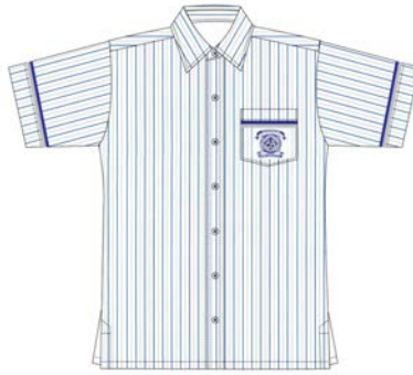
Formal Uniform - Boys Junior Striped Shirt - Short Sleeve