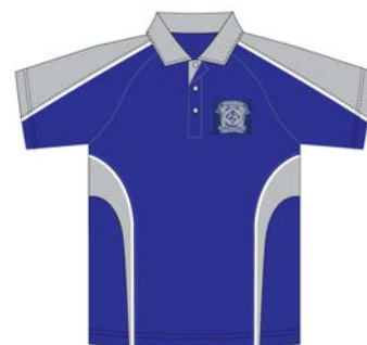
Sport Uniform Casual Polo Shirt - Short Sleeve