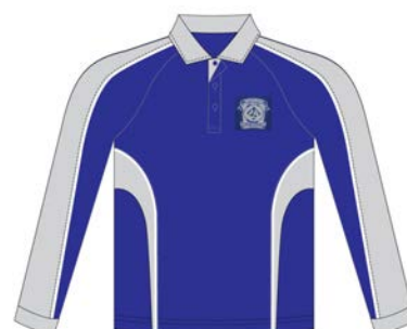
Sport Uniform Casual Polo Shirt - Long Sleeve