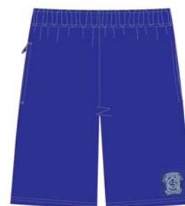
Sport Uniform Short