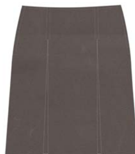
Formal Uniform - below knee length Skirt