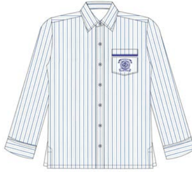
Formal Uniform - Boys Junior Striped Shirt - Long Sleeve