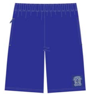
Sport Uniform Short