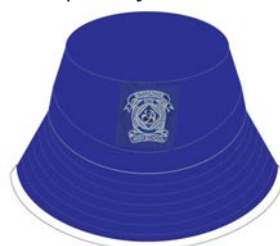
Compulsory School Hat