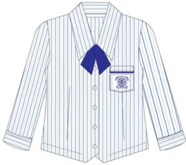
Formal Uniform - Girls Junior Striped Blouse - Long Sleeve and Tie