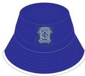
Compulsory School Hat