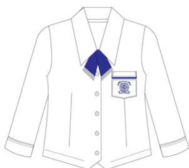
Formal Uniform - Girls Senior White Blouse - Long Sleeve and Tie