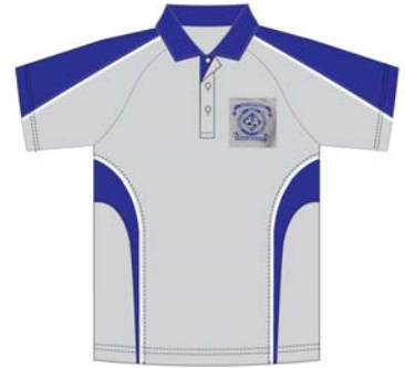
Sport Uniform Casual Polo Shirt - Short Sleeve