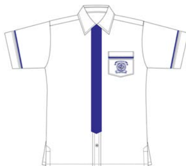
Formal Uniform - Boys Senior White Shirt - Short Sleeve and Tie