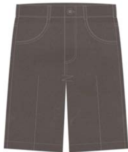
Formal Uniform - Short Unisex