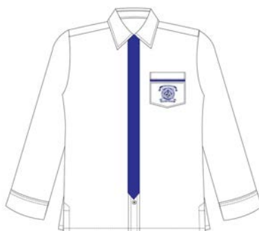
Formal Uniform - Boys Senior White Shirt - Long Sleeve and Tie